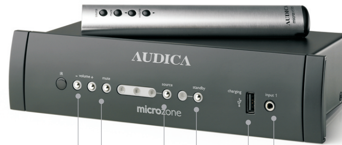
microzone control amplifier

For single-zone or multi-zone applications, the Audica MICROseries offers a stylish and unique solution with real flexibility from a compact range of products, operating within the low impedance domain to give true hi-fi quality.