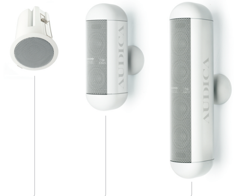
microline column loudspeaker