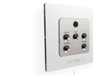
WMR Wall-mount remote